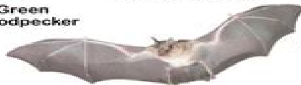
Greater Horseshoe Bat