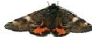
Light Orange Underwing Moth