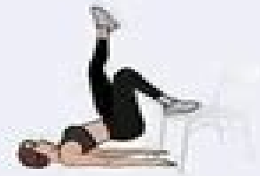
Adductor raises 3x15