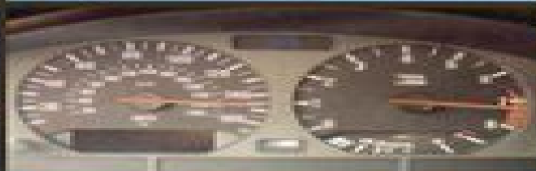
Leadfooted Imbecile licensus suspensus

Few places on earth can rival the road for the sheer multitude of morons to be found there. Packed with hundreds of photographs, maps, and illustrations, this book will enable you to identify each species of moron before they crash into you.