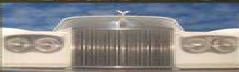
Common Tailgater accidentus frequentis