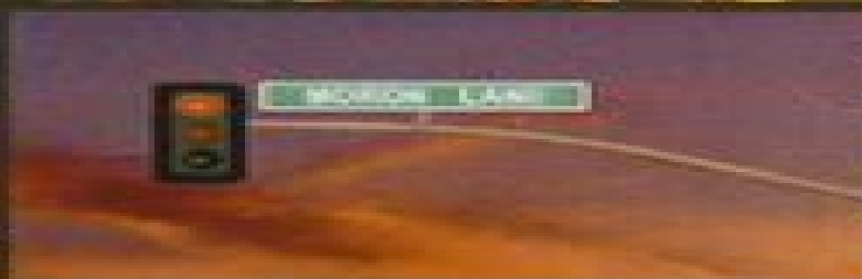
Redlight Runner stupidus colorblindus