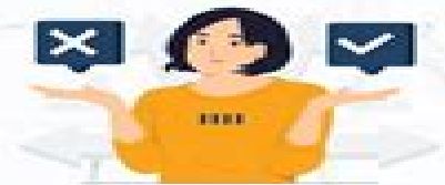
MAKING SOUND DECISIONS