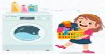
DOING THEIR LAUNDRY