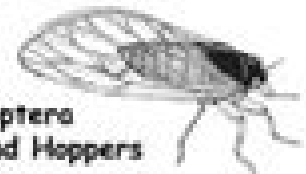
Homoptera Cicadas and Hoppers