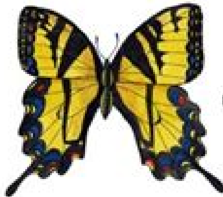
Lepidoptera Butterflies and Moths