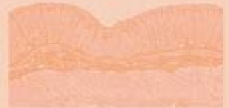
Improves Tissue Oxygenation