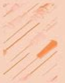
Immune System Stimulant