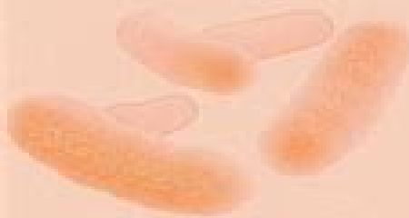
Germicide (bacteria, viruses, fungi)