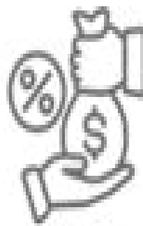
Load fund (sales charge or commission)