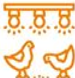
FEED AND NUTRITION MANAGEMENT