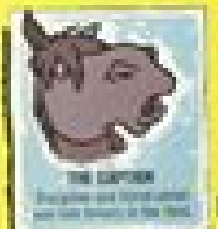
THE CAPTAIN A very elegant little dog who is the focus of the attack.