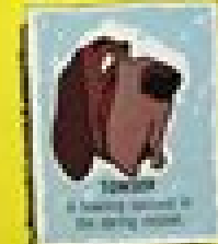
THE DOG A very elegant little dog who is the focus of the attack.