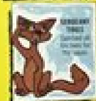
THE DOG A very elegant little dog who is the focus of the attack.