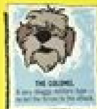
THE COLONEL A very elegant little dog who is the focus of the attack.