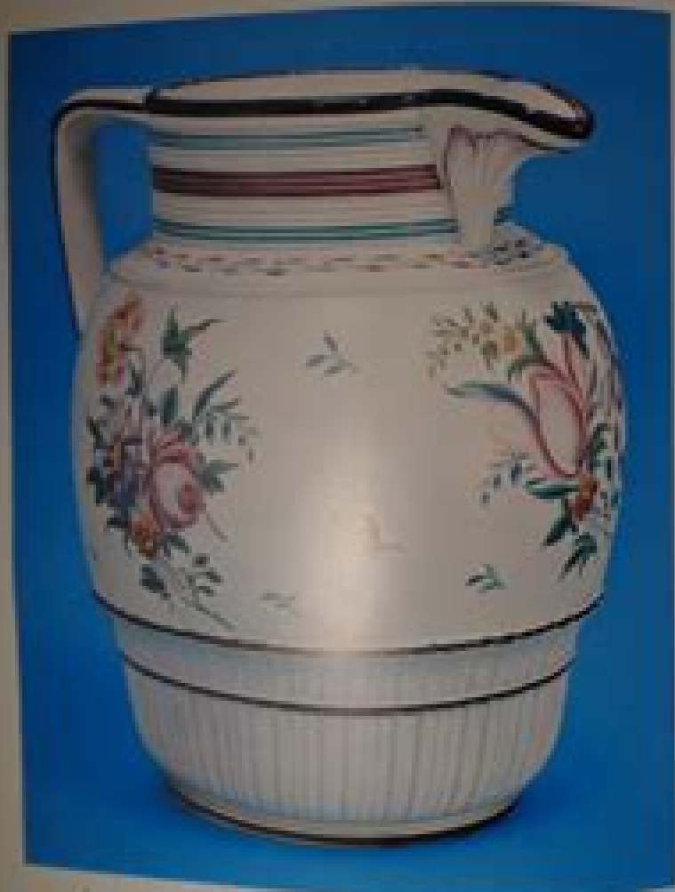
Amphora, 20th century, polychrome decorated decoration impressed decoration, c.1800, height 1 1/2".