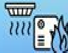
Smoke & Carbon Monoxide Detectors