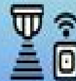
Ambient Motion & Presence Sensing