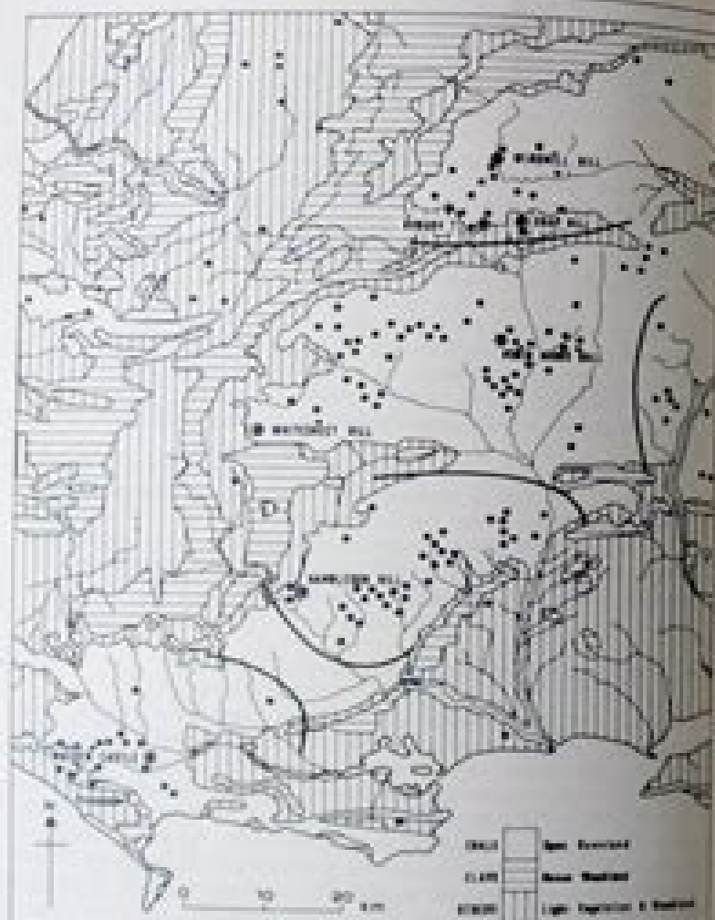
Figure 3. The Neolithic causewayed enclosures of Dorset and Wiltshire in relation to the long barrows. Note that each of Aubrey's barrow groups is served by an enclosure.

many centuries. The same is true of Medieval cathedrals, and is of course now well documented for Stonehenge, although Silbury Hill was the result of a continuous process of construction. The early Neolithic construction of cursus monuments would be more intelligible in these terms.