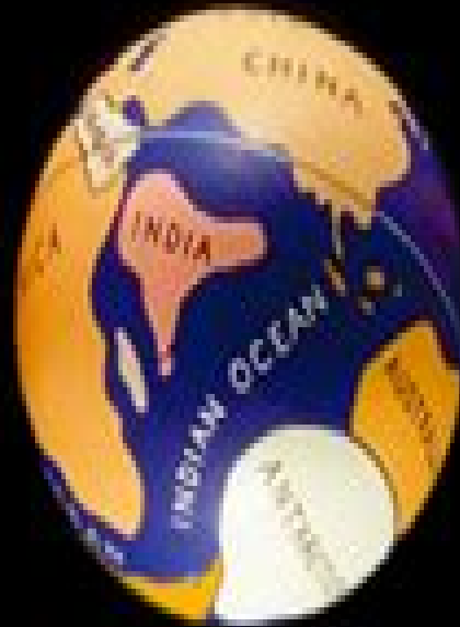
Cretaceous 80 mya