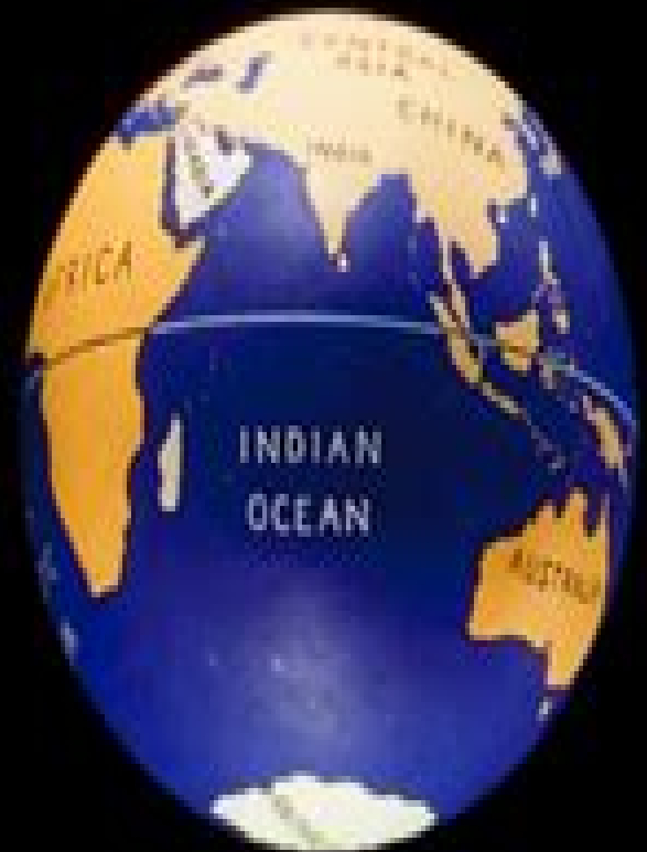
Modern 0 mya