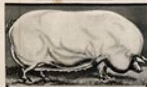
IMPROVED SUFFOLK HOG

Illustrated of all commercial pig breeds, and the contrast of ancient types with the modern baconer.