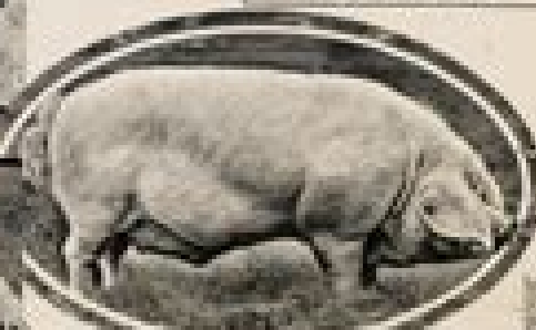
LONG WHITE LOPPED