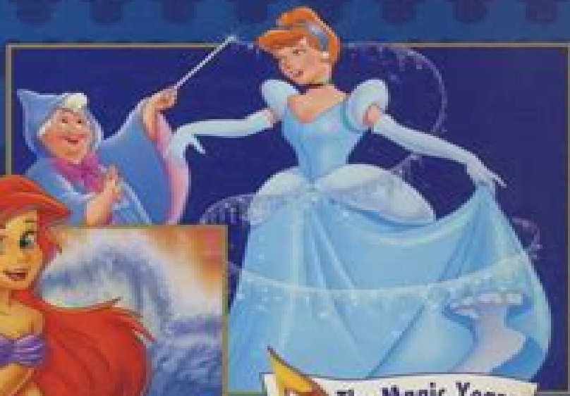
The Magic Years