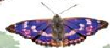
Purple Emperor Butterfly