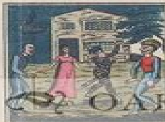
Rejoicing of the Old Appearance of each other.