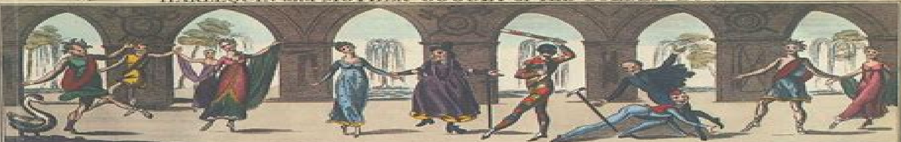
The Sub-marine Parition. — Mother Goose, visiting Harlequin and Columbian.