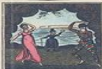
Mother Goose passing the Egg into the Sea.