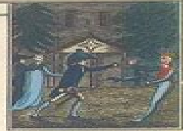
Entrance of Vinsburgh Gardens.