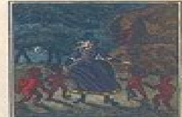
Mother Goose, passing Spirits, to see near the Egg.