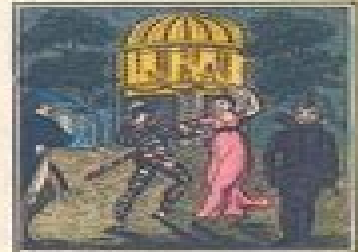
Interior of Vinsburgh.