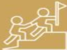
Leadership and people management