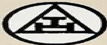
ROYAL ARCH MASON