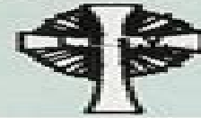
ORDER OF THE TEMPLE