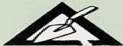
ROYAL & SELECT MASTERS