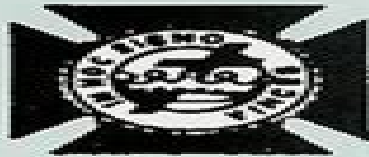
ORDER OF KNIGHTS TEMPLAR