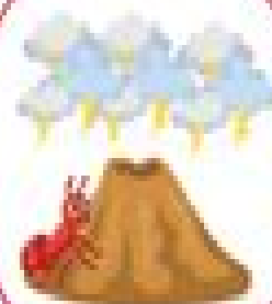
The Tale of the Brave Little Ant