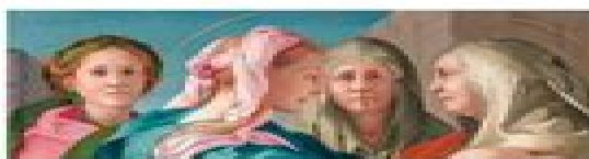
28 luglio '500 IL MANIERISMO PONTORMO - ROSSO FIORENTINO BRONZINO - BUONTALENTI