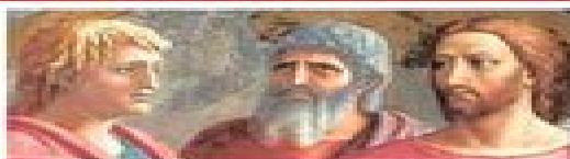
7 luglio IL '400 A FIRENZE MASACCIO - BRUNELLESCHI - DONATELLO