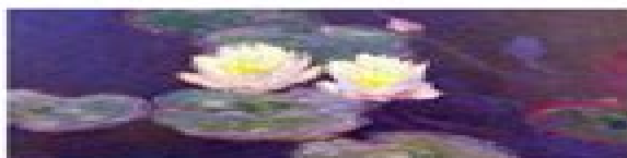
8 settembre IMPRESSIONISMO