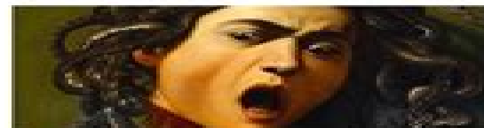
4 agosto '600 IL BAROCCO BERNINI - BORROMINI