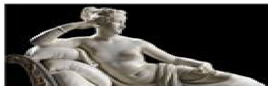
25 agosto '700 - '800 NEOCLASSICISMO DAVID - CANOVA - INGRES