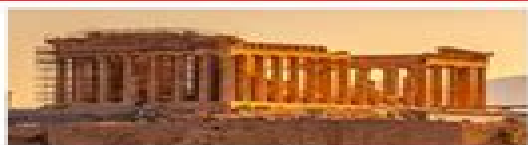
30 giugno LA GRANDE ARTE GRECA DAL VII SEC. AL II SEC. A.C.