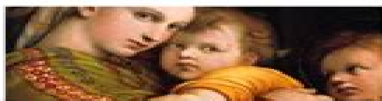
21 luglio '400 - '500 MICHELANGELO - RAFFAELLO - BOTTICELLI - TIZIANO