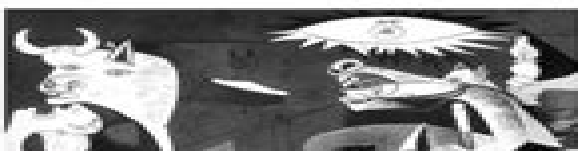
22 settembre '800 - '900 PICASSO