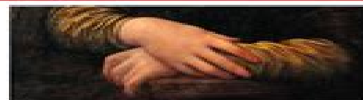
14 luglio '400 - '500 LEONARDO DA VINCI