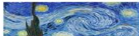
15 settembre '800 VAN GOGH