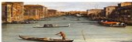
18 agosto '700 PAESAGGISTI VENETI CANALETTO - BELLOTTO - GUARDI