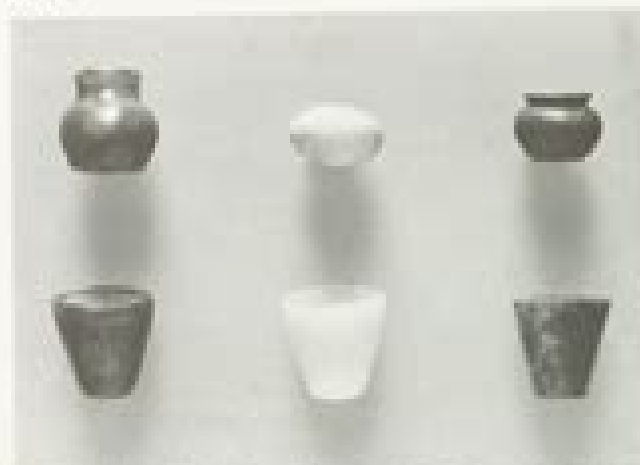
1. Three small vessels, top row right. Two small, dark, rounded vessels, 22, 23, left. One small, light-colored, bowl-shaped vessel, 24, bottom row. 25, Two small, light-colored, bowl-shaped vessels, 26, 27, middle row. 28, One small, dark, rounded vessel, 29, middle row, right.