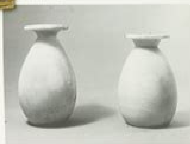
30. Two large vessels, 31 (left) and 32 (right).