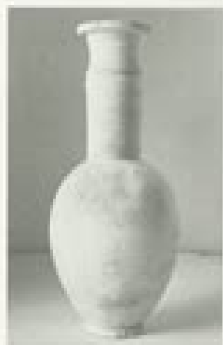
37. One large vessel, 38, long neck, 39, short neck.