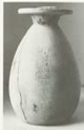
33. One large vessel, 34.