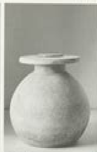
35. One large vessel, 36.