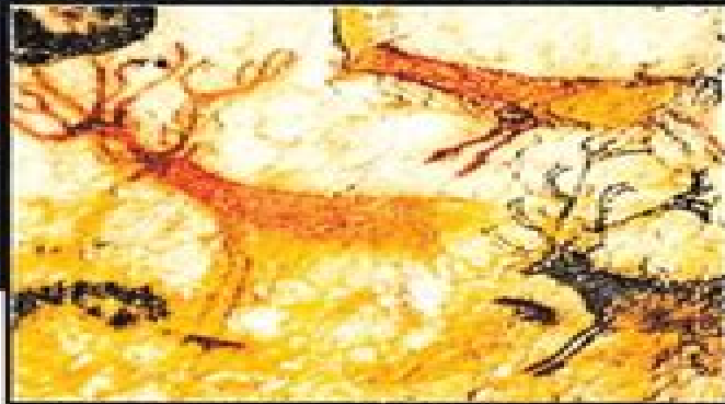
Graffiti - the curse of the modern age.

Tenants of the Lascaux caves in the Dordogne are hopping mad. They've been given two weeks to get out of their homes, all on ac-