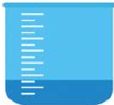
Capacity & Volume