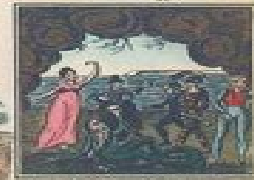
Mother Goose, with the recovery of the Egg.