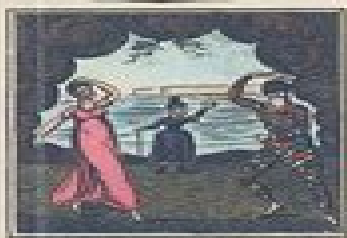
Mother Goose passing the Egg into the Jail.