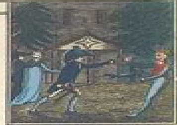
Entrance of Vinsburgh Gardens.