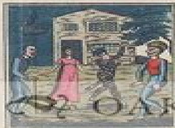
Repetition of the Old Appearance of each other.