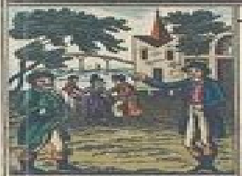
Mother Goose followed by others.