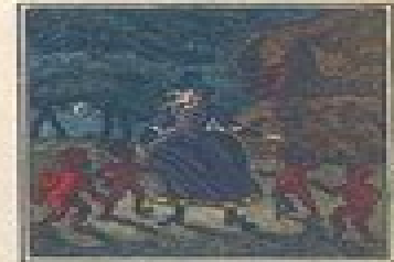
Mother Goose, passing the Egg, to the Jail.