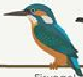
Eisvogel Alcedo atthis