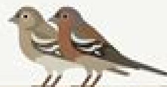
Buchfink Fringilla coelebs