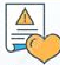
Norms and Values