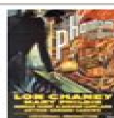
The Phantom of the Opera 1929

43005-8 Noble—Color Your Own Great Flower Paintings $3.95