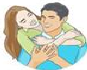
Spending Quality Time with Family/Friends