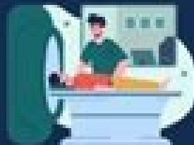
MRI Brain Scan