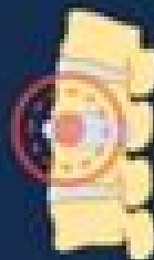
Spinal Tap or Lumbar Puncture