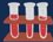
Blood Tests and Urine Tests