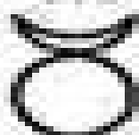
The Horned God