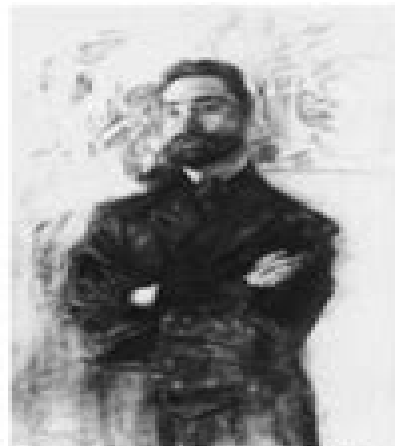
Valeri Brudov, Portrait of the poet Valeri Brudov (1875–1904), 1893, charcoal, sanguine, oil on paper, 49 x 27 cm (Tretyakov Gallery, Moscow)