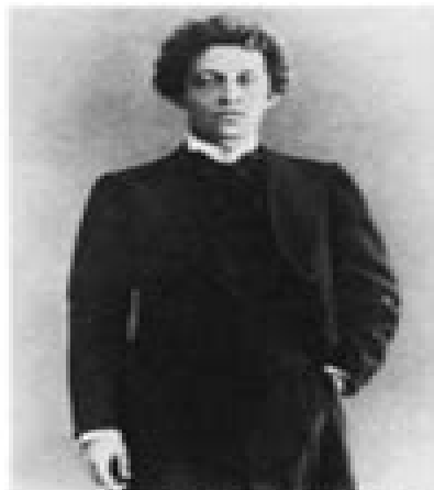
Portrait of Aleksandr Blok, 1907