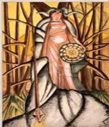
Princess of Disks