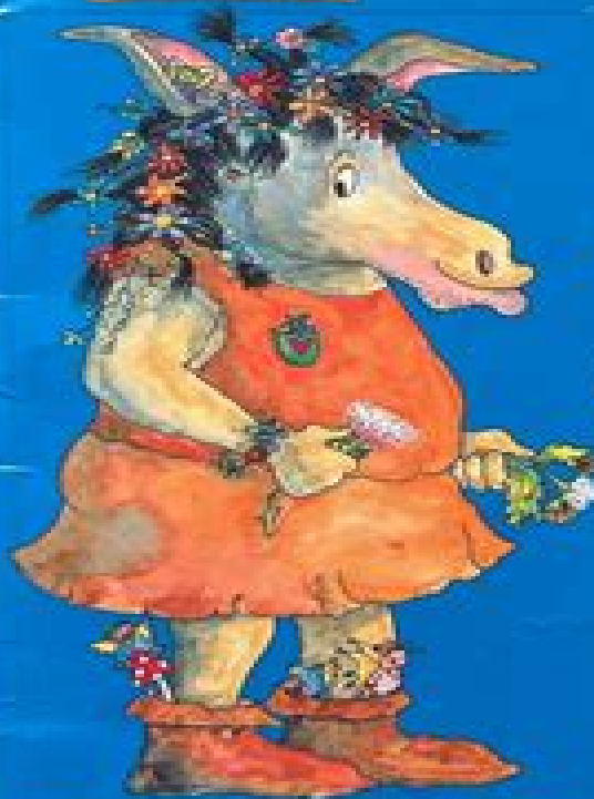
A Midsummer Night's Dream