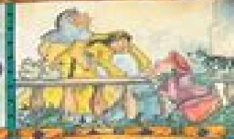
Romeo and Juliet