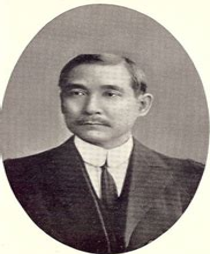
SUN YAT SEN

Inscriptions on the original, written by Sun Yat Sen, read: right, "Brother Ai for preservation"; left, "Respectfully given by Sun Wen."