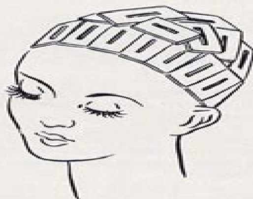
Single Halo—Front View