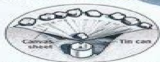
Airmen stranded in the desert can make a canvas and stone still to collect water.

Below lay the sand and with feet out, it was very something.