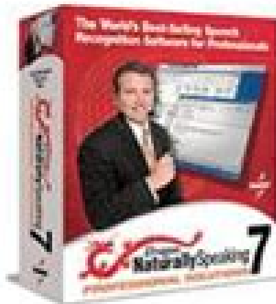
Dragon Naturally Speaking 7.0 or 7.3