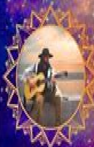
CALEB AUSTON | KANAPE

A DAY OF CACAO, KIRTAN AND ECSTATIC DANCE