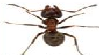
Velvety Tree Ant