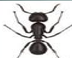
Dark Rover Ant