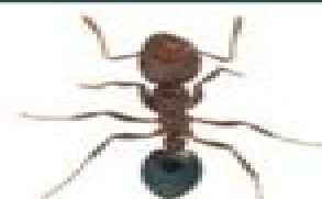
Red Imported Fire Ant