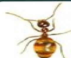
Small Honey Ant