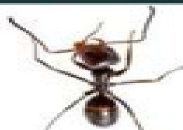
Bicolored Pyramid Ant