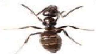
Odorous House Ant