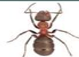
Formica Ant (Wood Ant)