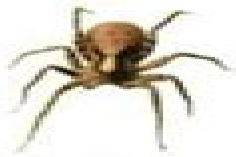
Arctic Wolf Spider