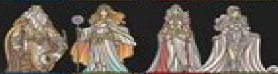
SVETVIDOG | LADA | ZORYA | MOKOSH