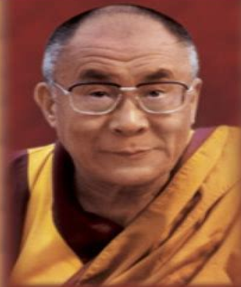
His Holiness The XIV Dalai Lama

A Practical Approach to a Meaningful Life