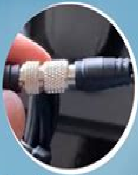
Sensitive Connection between fish finder and Sonar 2 transducer