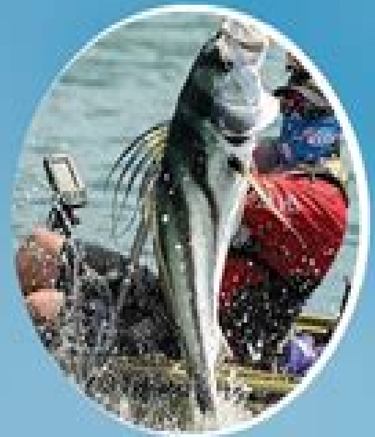
Positioning Accuracy big catch