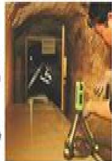
Detectors being set up in Queen's Chamber

The technology measured muons, a by-product of cosmic rays from stars exploding in the universe and raining down to earth at nearly the speed of light. More muons pass through voids than through stone, as stone absorbs them. Detectors were placed in the Queen's chamber, the descending passageway and outside the pyramid near its north face.