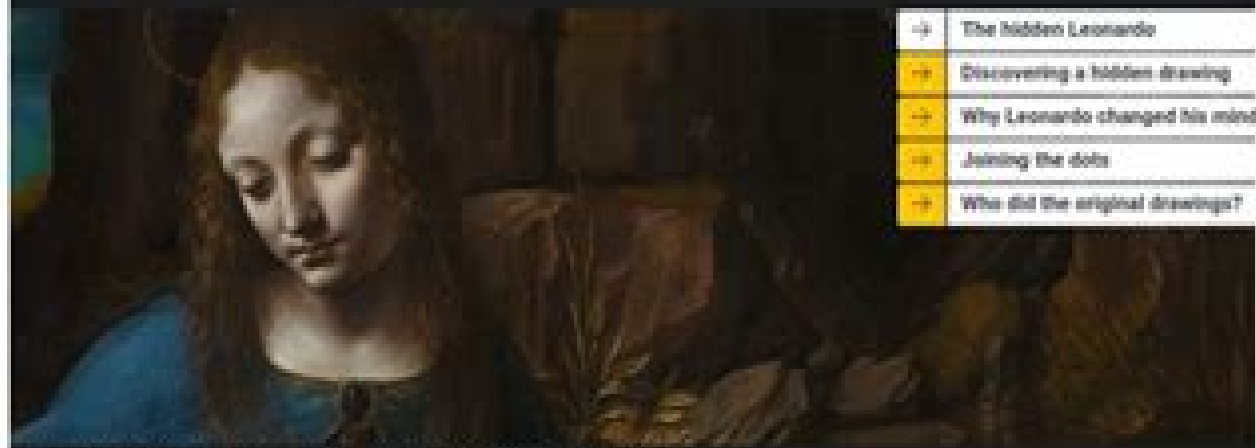
Leonardo da Vinci, 'The Virgin of the Rocks', about 1491/2-9 and 1506-8

Uncover the hidden painting behind one of the most celebrated masterpieces at the Gallery, Leonardo's 'The Virgin of the Rocks'.