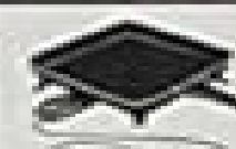
Electric Fly Fans