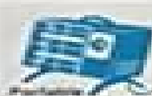
Portable Electric Heaters