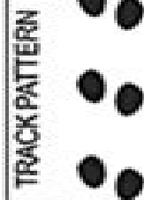
OTTER - 1 1/2"