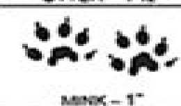
MINK - 1"