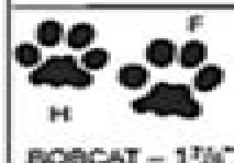
BOBCAT - 1 7/8"