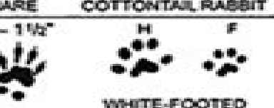
WHITE-FOOTED MOUSE - 1/4"