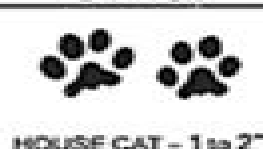
HOUSE CAT - 1 to 2"