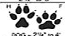
DOG - 2 1/4" to 4"