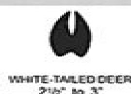
WHITE-TAILED DEER 2 1/2" to 3"