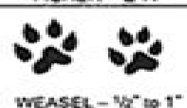
WEASEL - 1/2" to 1"