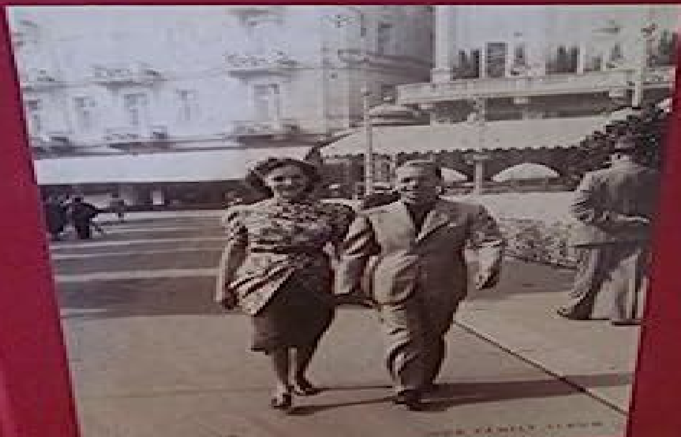
Sis & Pa