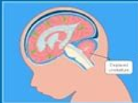
Chiari II Malformation

back of brain is pulled down out the skull into top of the spinal canal