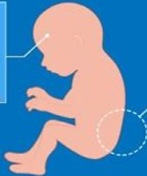
Normal spinal cord in infant